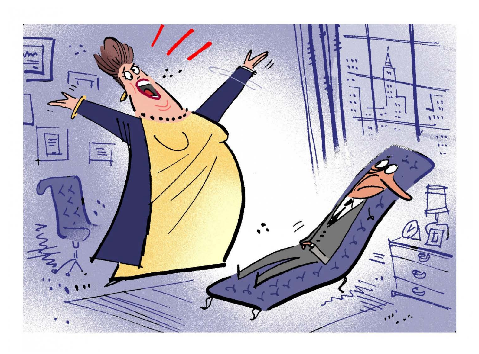
"Everything's Come Up Neurosis," this week's winning song parody.